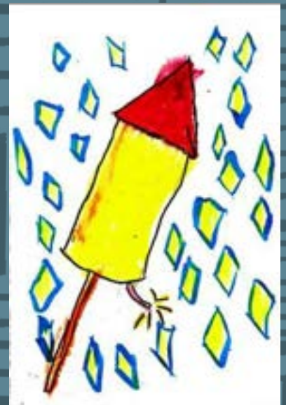
~Anvit Kappor 1G