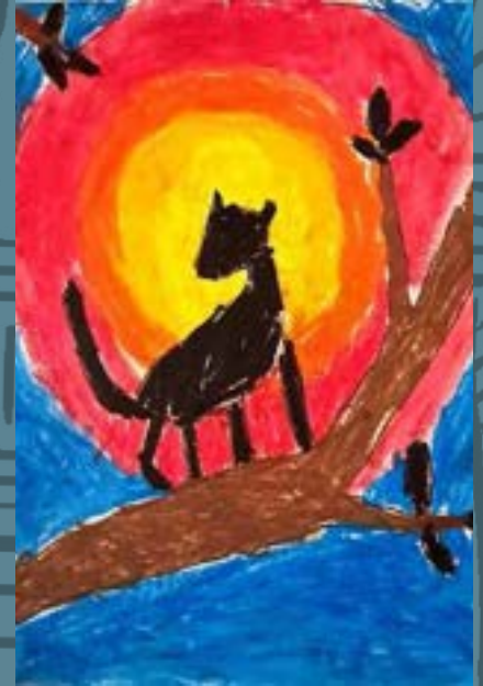
~Anvit Kappor 1G